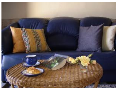
Some photographs illustrating The Lavender Room.